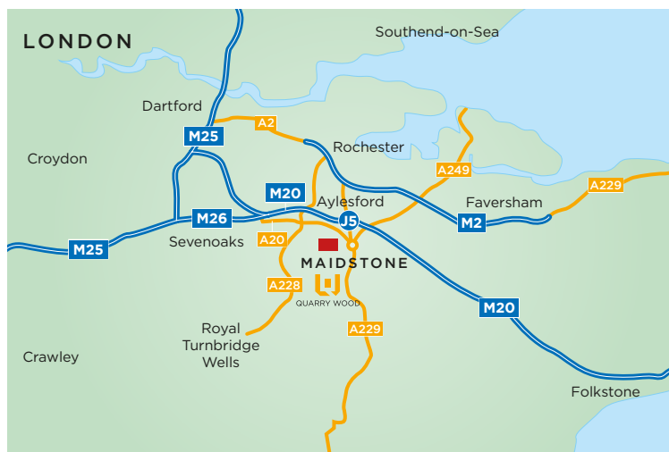
Quarry Wood Industrial Estate Aylesford Kent ME20 7NA