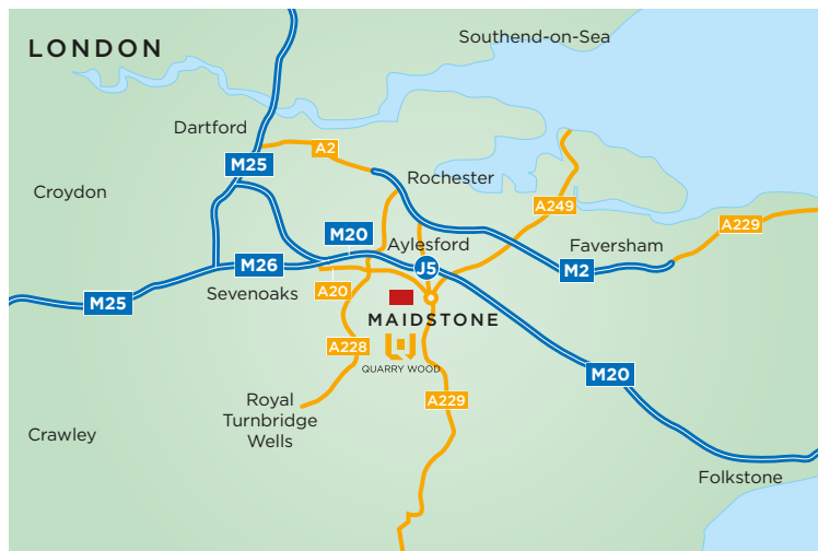
Quarry Wood Industrial Estate Aylesford Kent ME20 7NA